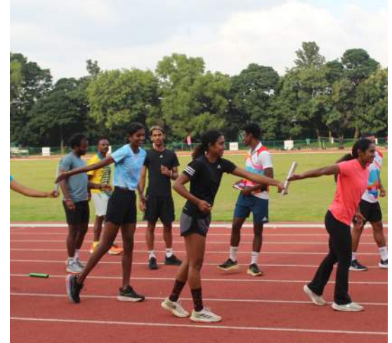
Athletes in action during practice session in Bengaluru.

Apart from individual events, the national team will also compete in 4x400m relay and 4x400m mixed relay events, the chief junior athletics coach said.