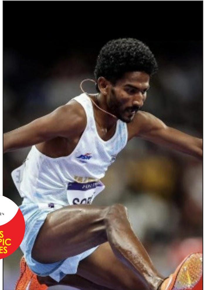
Avinash Sable in action during the men's 3,000m steeplechase at the 2024 Paris Olympic Games.