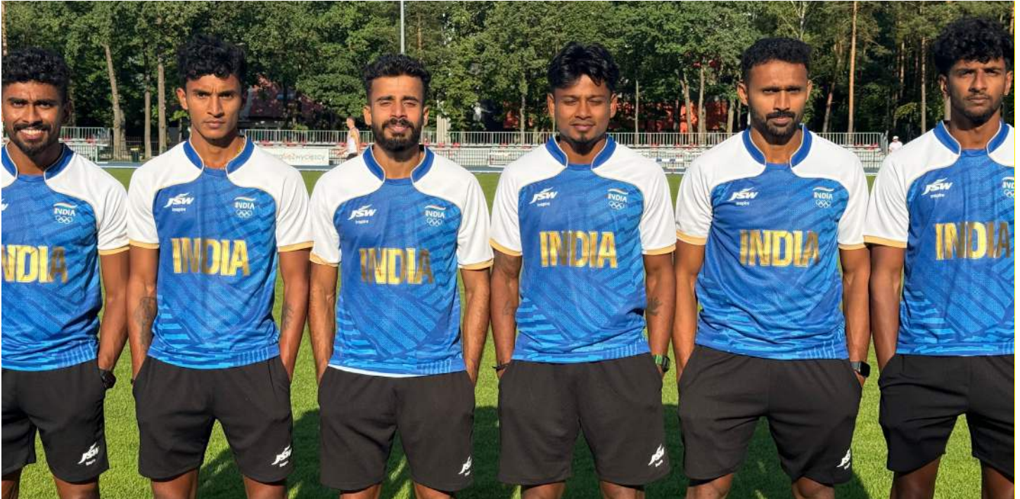
Members of the Indian 4x400m relay team.

It was yet to close yet so far for the elite Indian quarter-milers at the Paris Olympic Games. After a stupendous 2023 season of twice improving the Asian 4x400m relay record there was hope of another astounding season. The 2024 Paris Olympic Games was supposed to be a perfect platform to further showcase potential. Despite good efforts the Indian 4x400m relay team narrowly missed out to advance to the medal round.