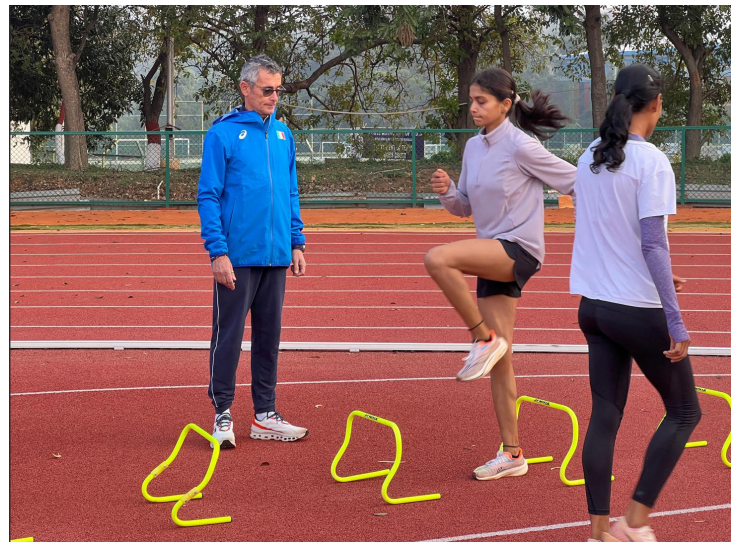
Middle and long distance runners during a training session at SAI Campus in Bengaluru.

Pannozzo has made some modifications to the training plan. One of the key changes was to reduce the distance of long runs and incorporate short, faster runs in the weekly