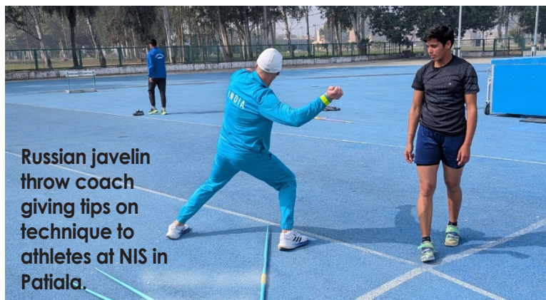
Russian javelin throw coach giving tips on technique to athletes at NIS in Patiala.