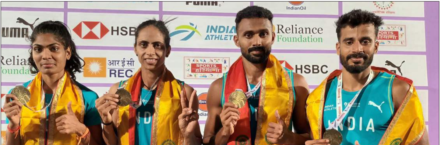
Members of India A mixed 4x400m relay team ceremony.