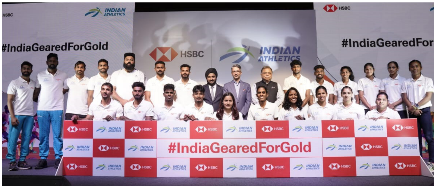
Members of the Paris bound Indian athletics team pose for a photograph at HSBC send off ceremony.

It was a grand send off ceremony to Paris bound track and field athletes by HSBC India and AFI (Athletics Federation of India) earlier this month in Chandigarh.