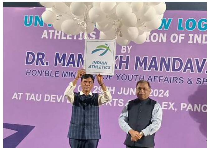
Hon'ble Sports Minister Mansukh Mandaviya unveils AFI logo in presence of AFI president Adille Sumariwalla.

The sports minister said youth of the country are eager to showcase their potential in sporting events at the world stage. "The preparation of the Paris bound Indian contingent has gone well," the sports minister said. "We are expecting good results in Paris."