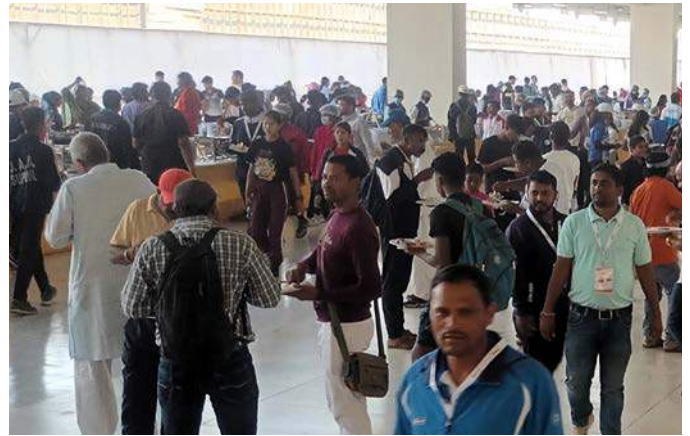
Huge dining hall could accommodate more than 1,000 athletes in one batch.