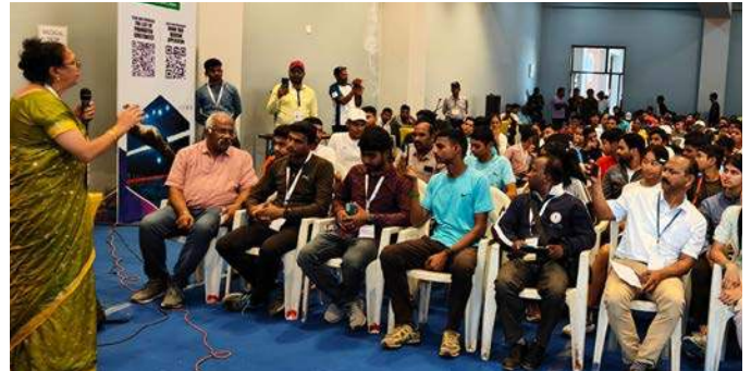
Budding athletes were apprised about the guidelines of Safeguarding Athletes from Harassment and Abuse in Sports (SAHAS).