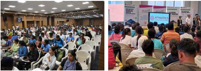
Seminars were conducted on all three days during NIDJAM.