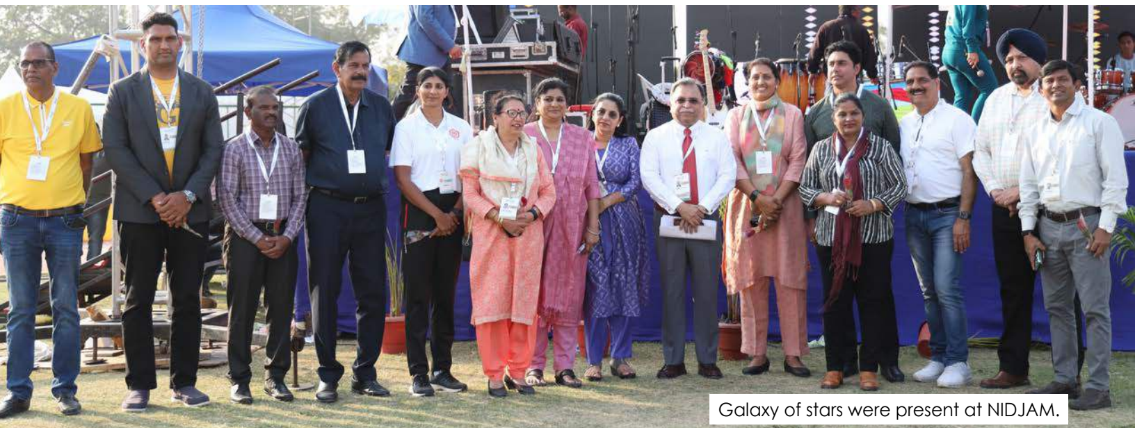
Galaxy of stars were present at NIDJAM.

The 19th edition of the National Inter District Junior Athletics Meet (NIDJAM) held at Gujarat University Campus eight-lane synthetic track between February 16 to 18 in Ahmedabad has further raised the bar of the largest grassroots programme in the world.