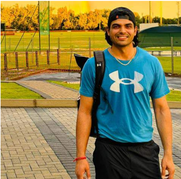
India's Olympic and world champion Neeraj Chopra. (Right) Parul Chaudhary.