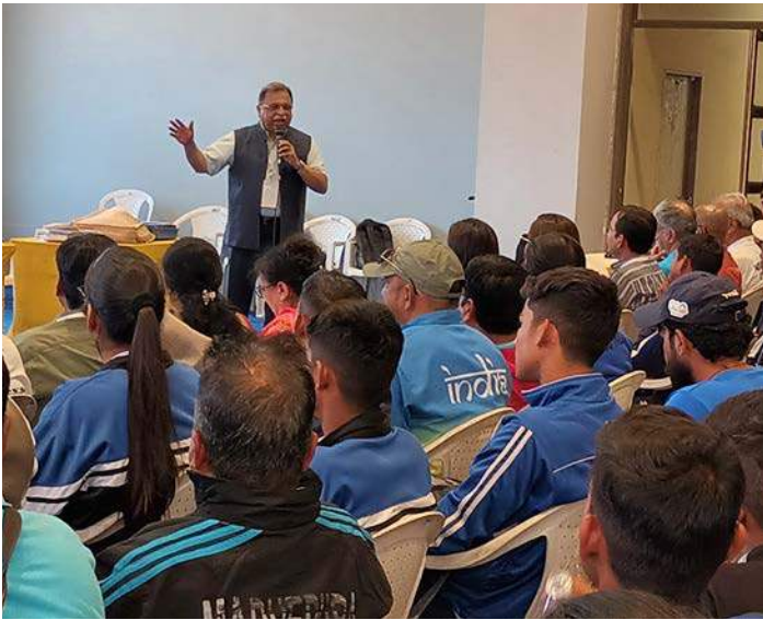
Adille Sumariwalla, President AFI apprising budding athletes on the harmful side effects of using performance enhancing drugs banned by World Anti Doping Agency (WADA),