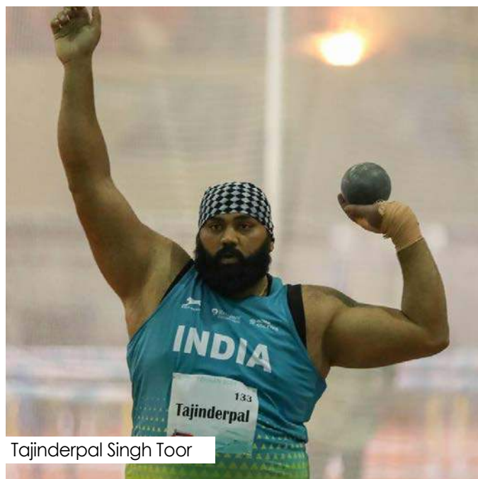
Tajinderpal Singh Toor

At the 2024 Asian Indoor Championships the